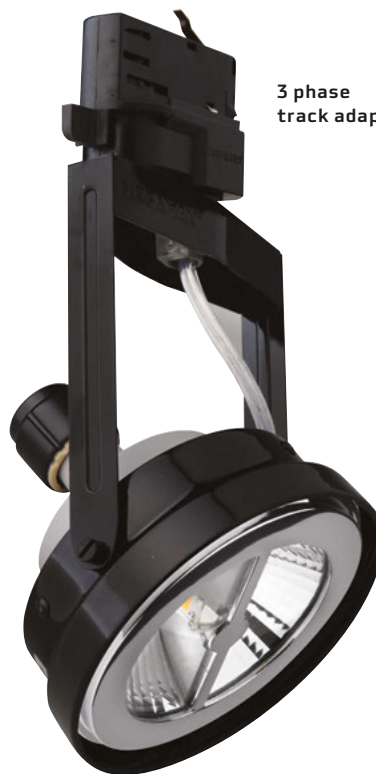
3 phase track adaptor