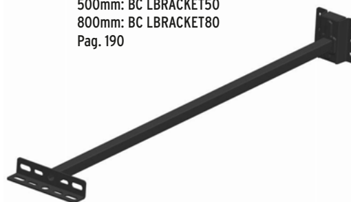
Floodlight Support 500mm: BC LBRACKET50 800mm: BC LBRACKET80 Pag. 190